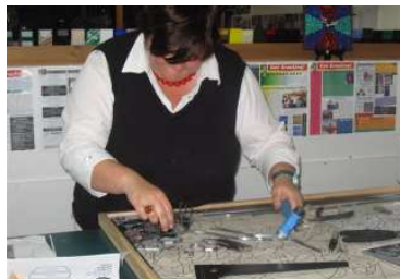
Annie's Magnolia Window