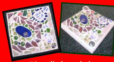
"A walk through the garden" featuring glass, pottery, shells and nuggets.