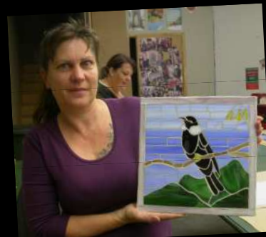
Thursday nights Keep-On and Mosaic class had a real mixture of mediums going on. Mosaics of course, glass whirls and lampshades.