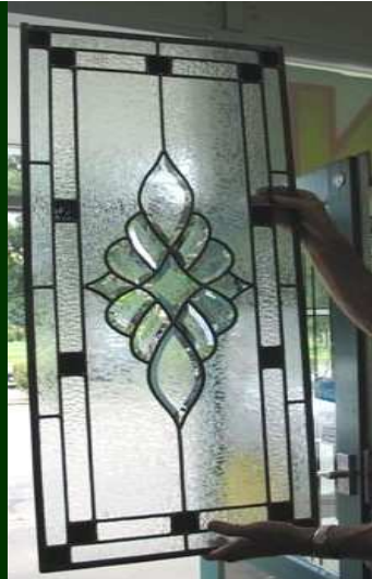
Chris completed this beautiful leadlight window panel at our Keep-on-leadlighting class.