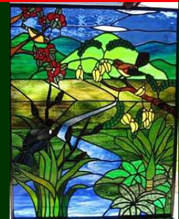
Native NZ Leadlight Feature Panel